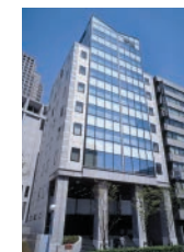
▲ Osaka Headquarters (Umeda, Kita-ku, Osaka)