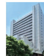
▲ Tokyo Head Office (Ginza, Chuo-ku)