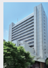
▲ Tokyo Headquarters (Ginza, Chuo-ku)