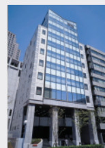
▲ Osaka Headquarters (Umeda, Kita-ku, Osaka)