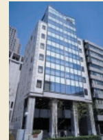
▲ Osaka Headquarters (Umeda, Kita-ku, Osaka)