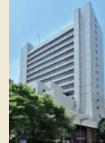
▲ Tokyo Headquarters (Ginza, Chuo-ku)